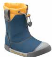
Keen Encanto Rainboot 365