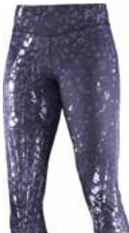
Elevate 3/4 Tight

The problem with most performance tights are they fit in some places and don't in others, making it nearly impossible to find a perfect pair. Salomon's Elevate 3/4 Tight features a wide and adjustable waistband, making the pant usable for a wider range of users. This adjustability is also great when you consider how your own body may fluctuate throughout the years. Since the apparel will still work, don't make fit a reason to buy another pair. Elevate's stretch fabric makes them great for running, yoga, hiking, cycling, or pretty much any kind of active movement. Even running out for errands is an excuse to wear the Elevate, since its unique color patterns make the technical piece a lifestyle crossbreed. It seems Salomon is adapting to the Athleisure trend like many other outdoor brands. Only these tights will be more moisture wicking and efficient at temperature regulation than Big Box alternatives. MSRP $70