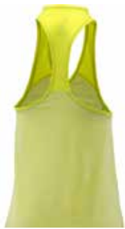
Elevate Tank Tunic

performing top, but the new 2016 Elevate Tank Tunic for Women incorporates style cues into its cut. The slightly looser fitting tank, made with patented AdvancedSkin ActiveDry and a stretch jersey fabric, has a longer hem, which elongates the torso for a more flattering line. The tunic is versatile as well, and can be worn both over a sports bra or, for cooler weather, over a cami to keep your mid-section warm. MSRP $40