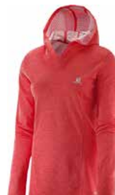
Elevate LS Hoodie

In the realm of apparel, the Elevate LS Hoodie satisfies both performance and comfort, which is always a plus for high-price apparel investments. A hoodie made for the early riser, the super soft and loose fitting piece is ideal for a morning warm up, before or after yoga, or anytime you want lightweight comfort. The hood has a crossover base for easy fit and the bottom hem has a longer, flattering silhouette. Beneath the surface an AdvancedSkin ActiveDry and odor-control fabric keeps the material dry and smelling fresh. The days of soggy post-run coffee dates are done. MSRP $70