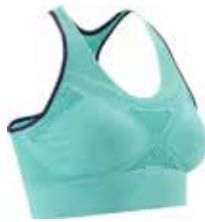
Medium Impact Bra