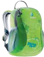
Deuter Pico Bag