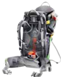
Deuter Kid Comfort Air

no-tool assembly kit that can be configured as a bunk, sitting bench or two single cots, and does not require a mattress. Through the company's success with Disc-O-Bed, they are able to release the Kid-O-Bunk with the same durability of the Disc-O-Bed at a price to match parental budgets.