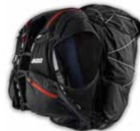
S-Lab Peak 20 Set

Although not a piece of apparel in the traditional sense, wearing the S-Lab Peak 20 Set will feel as natural as putting on a shirt to go out running. Ideal for alpine running, superlight mountaineering and fast hiking, this pack takes stretch fit and a completely stabilizing design to promote fast speeds in a comfortable way. There is convenient access to the 20L compartment, and both the pack and the load are easy to compress for maximum stability when only filled part way. If you need more storage, two 500ml soft flask solutions are available. Other details of the S-Lab Peak 20 construction include elastic pockets, a 4d pole holder, and two shoulder expandable pockets. The pack fabric boasts a silicone coated waterproof 500mm 70D nylon triple ripstop, so water won't get in and the trail won't tear through. MSRP $225