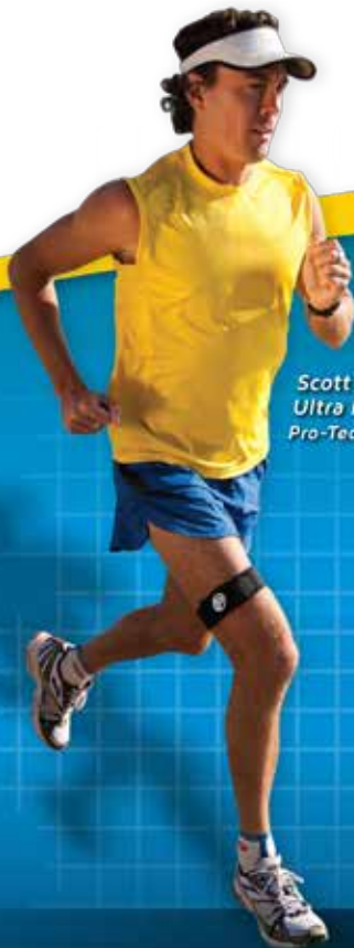
Scott Jurek Ultra Marathon Champion Pro-Tec Elite Athlete