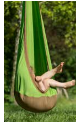
La Siesta Joki Hanging Nest