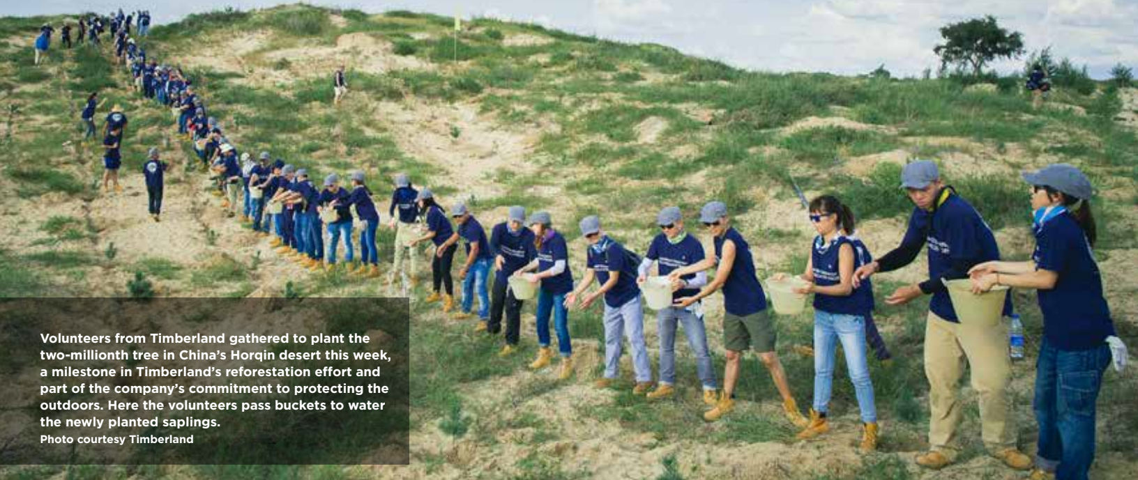
Volunteers from Timberland gathered to plant the two-millionth tree in China's Horqin desert this week, a milestone in Timberland's reforestation effort and part of the company's commitment to protecting the outdoors. Here the volunteers pass buckets to water the newly planted saplings.