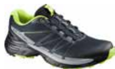
Wings Pro 2

If the track is technical then steer toward the Wings Pro 2 , made to suit all types of trail conditions. Salomon recognized the anxiety that often accompanies runners descending a technical trail, when momentum can overpower deliberate footing. This is the real trouble spot, where the majority of accidents occur. The company's trademarked EndoFit and reinforced SensiFit holds the foot in place and works with the shoe's Quicklace system to keep feet snug yet comfortable (no loss of circulation here). A dual density mid-sole protects against rocks underfoot and Wet Traction Contragrip is a back-pocket tool you're thankful to have when the weather unexpectedly turns. This wet weather grip is distinguished by its deep and sharp-edged lugs made of two different rubber compounds. Wave slipping and sliding goodbye. MSRP $140