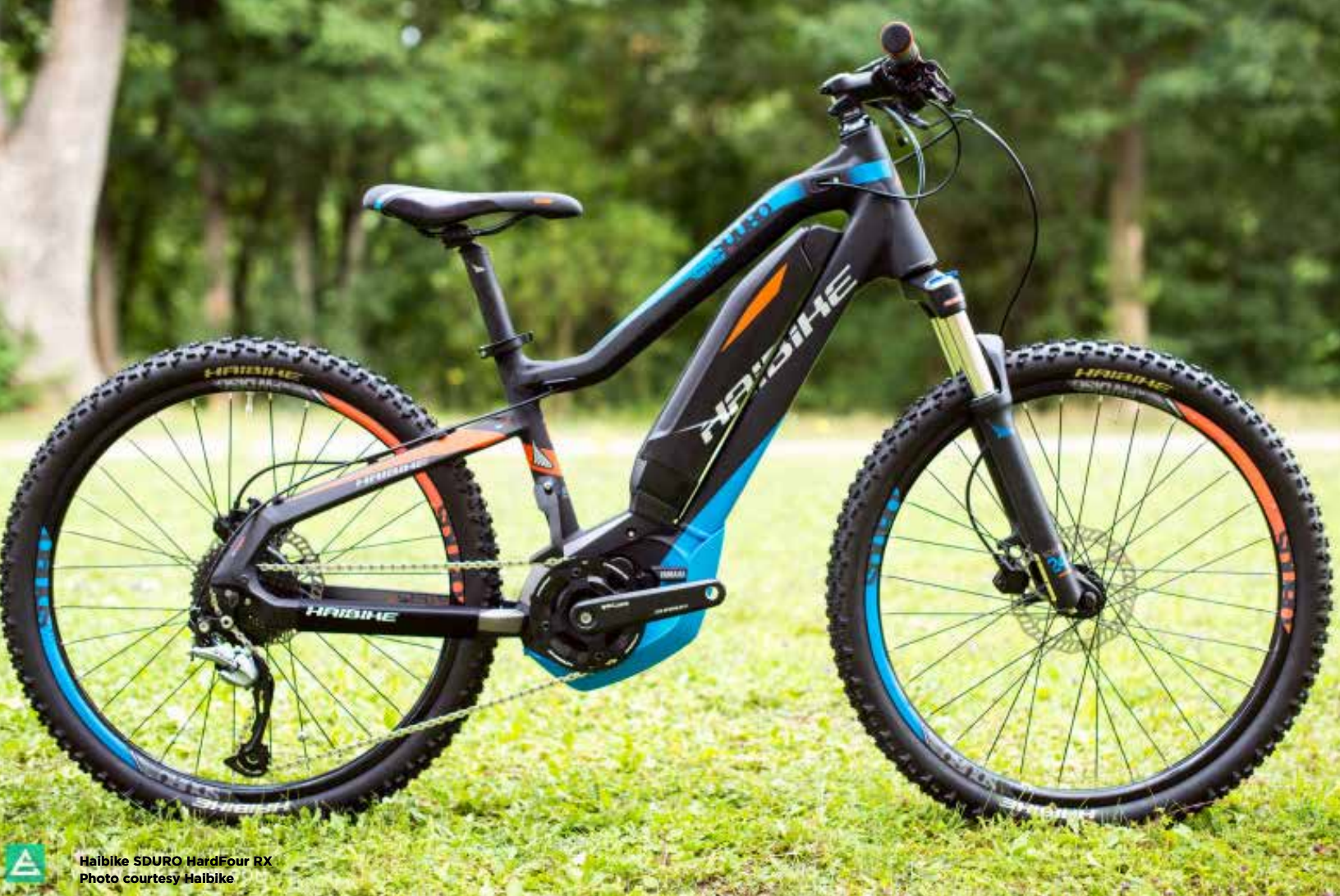
Haibike SDURO HardFour RX