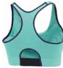
Medium Impact Bra

wicking moisture in perhaps the most necessary area of all. Without this wicking, painful chafing ensues. The Medium Impact Bra is also sophisticated for its seamless design—another step toward no more irritation. Salomon also made the sizing easy to select, with a straightforward Small, Medium, and Large option. However cookie cutter those sizes may sound, there is also self-adjusting to tailor exactly to your shape. The padded cups are removable, and the medium support should keep secure through easy runs and hikes. MSRP $48