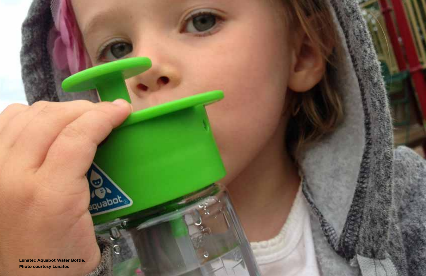
Lunatec Aquabot Water Bottle.