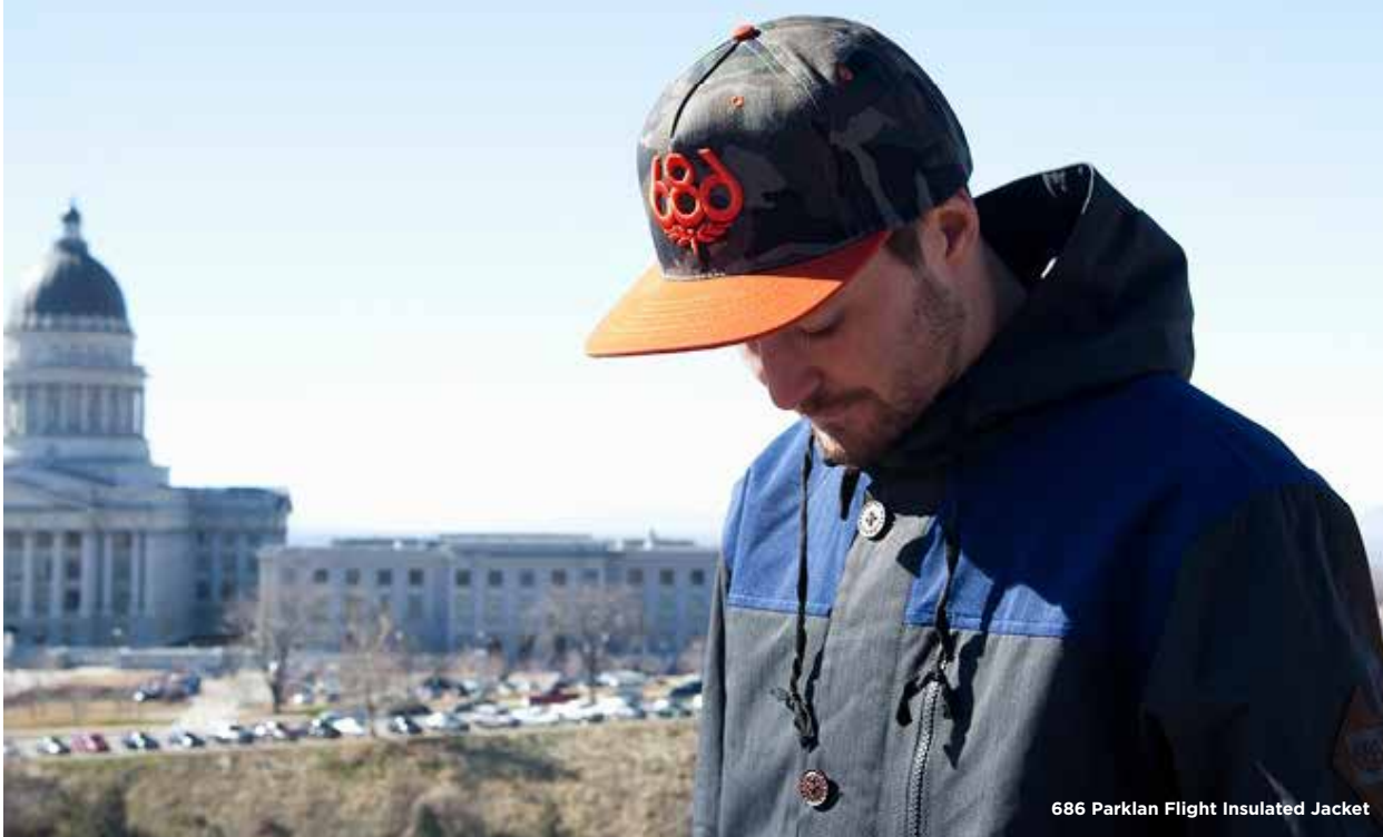
686 Parklan Flight Insulated Jacket