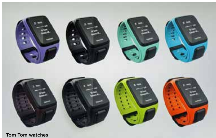
Tom Tom watches

The Spark, like most fitness wearables on market, would not be complete without social sharing functions. Users can upload their fit stats via the MySports app, and review their progression wirelessly.