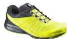
Sense Pro 2

of recreational trail running for those who really do just want to smell the roses, without the torture of terrain, Salomon created the Sense Pro 2 . Softer landing and easier transitions come about from the protective yet smooth design and technology. Mixing EndoFIT with Ortholite Impressions and SensiFIT yields a premium foothold, even if the track doesn't require tons of grip. A technology called Energycell+ absorbs shock while promoting rebound. But no, it won't do the running for you. MSRP $130