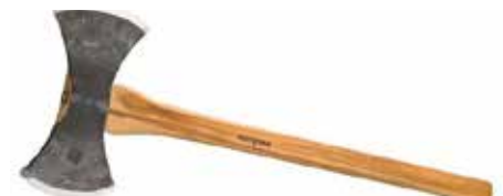
Motala Double Bit-Throwing Axe

The brand will introduce two lines exclusive to the U.S. market. The Premium Series of axes are "handmade works of art" with meticulous attention paid to the finish. Six axes, ranging from the compact Jonaker Backpacking Hatchet to the Motala Double Bit-Throwing Axe, are designed for hard outdoor use. They include a tanned leather axe head cover. The Standard Series features a more rustic finish designed to perform at the highest level while offering value to those who desire a Swedish steel axe, at a competitive price.