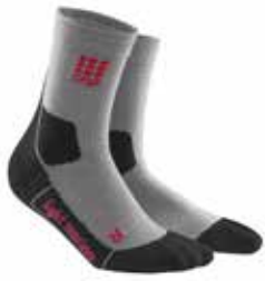
CEP Dynamic+ Outdoor Light Merino Short

Short, $20. Its combination of fine merino wool and polyamide fibers provides a light-and-fast profile for athletes in the market for a minimalist sock with compression. The dual advantages of the Dynamic+ show CEP's movement toward acceptance as a sock brand, not a compression brand.