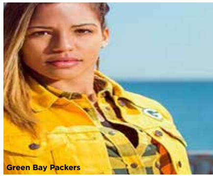
Green Bay Packers