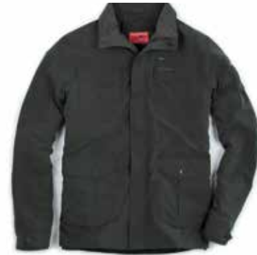
The Nosilife Adventure range

feedback, altering products to perform better based off these in-the-field recommendations. For instance, Craghoppers' 2016 Adventure Travel range includes features like crease-resistant fabric, hidden passport pockets, sewn-in sunglass cleaner, vented back design, drying loops and RFDI credit card protection.