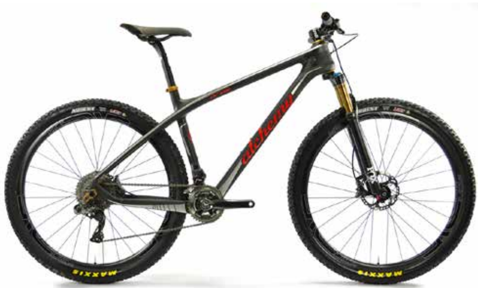
Alchemy Oros Hardtails