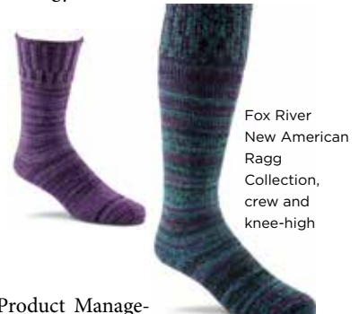
Fox River New American Ragg Collection, crew and knee-high

In the lifestyle segment, brands are trying new twists on traditional silhouettes while incorporating vintage flair in the designs and finishes. Take Wigwam's throwback to the tube sock, the Courtside, $15. They've updated the old standby with Dry Release and Tencel technology, but the essence of the well-known ragg wool look remains. In the same vein, Fox River's New American Ragg Collection, $15 for the crew, $18 for the knee-high) incorporates bright colors and Wick Dry Moisture Management Technology to update the classic look.