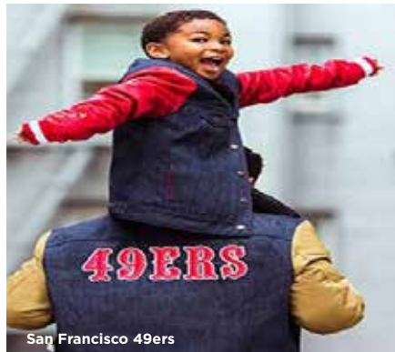
San Francisco 49ers