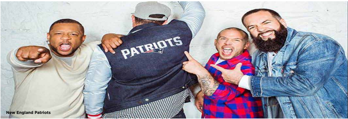
New England Patriots