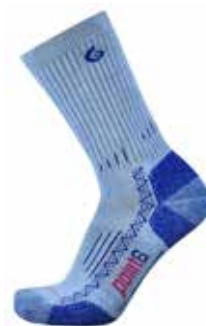
Point 6 Hiking Tech Sock (top) and Boot Sock (bottom)

Those looking for a low-profile hiking sock with true compression benefits will appreciate CEP's Dynamic+ Outdoor Light Merino