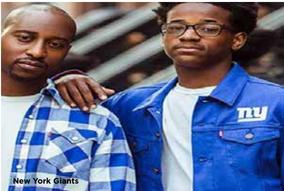
New York Giants