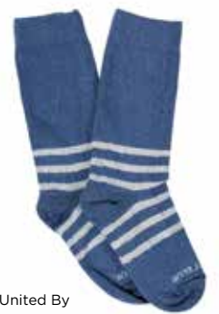
United By Blue Bartrams lifestyle collection

Made of 65 percent recycled cotton, United By Blue adds an environmental story to its new Bartrams lifestyle collection, $12. Their muted designs - choose from mountain-esque patterns, asymmetrical stripes and classic polka dots - subtly show off an outdoor aesthetic. "It's a recollection of that nostalgic romance of the outdoors for the consumer who's wearing it," said United By Blue Founder Brian Linton. "People want to be connected with the outdoors even if they're not in the outdoors." ■