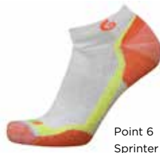
Point 6 Sprinter