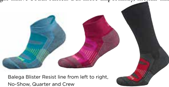
Balega Blister Resist line from left to right, No-Show, Quarter and Crew

Balega updates its Blister Resist line, $13 for the No-Show, $14 for the Quarter and $15 for the Crew, with Drymo: a Dynamix Mohair foot bed for protection against sheer friction blisters. Why mohair instead of the traditional merino? For one thing, mohair is a major export of Balega's native South Africa. But more importantly, mohair has a completely flat, snake-like scale structure when it gets wet. In contrast, damp merino strands have a barb-like structure that can lead to friction and irritation. "There's no chance of traditional blistering [with mohair], even in wet conditions," said Balega's Vice President of Marketing and Sales, Tanya Pictor. "For a trail runner going through different environments and streams, there's no chance [of blisters], even with wet feet."